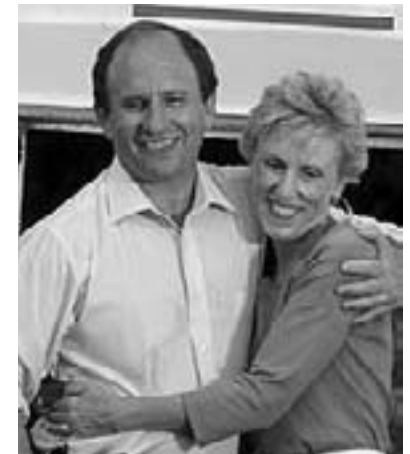
Paul and Sheila Wellstone